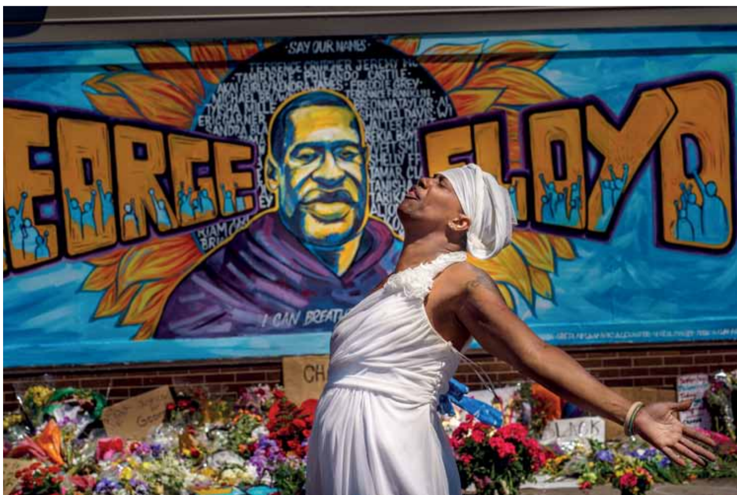
MAY 30, 2020 | MINNEAPOLIS, MINNESOTA A woman reacts at a memorial for George Floyd following a day of demonstration in a call for justice for George Floyd, who died while in custody of the Minneapolis police.

CENTRO CULTURAL PENEDO DA SAUDADE TUE TO SUN 14.00—20.00 Ø MON 29 MAY—31 JUL