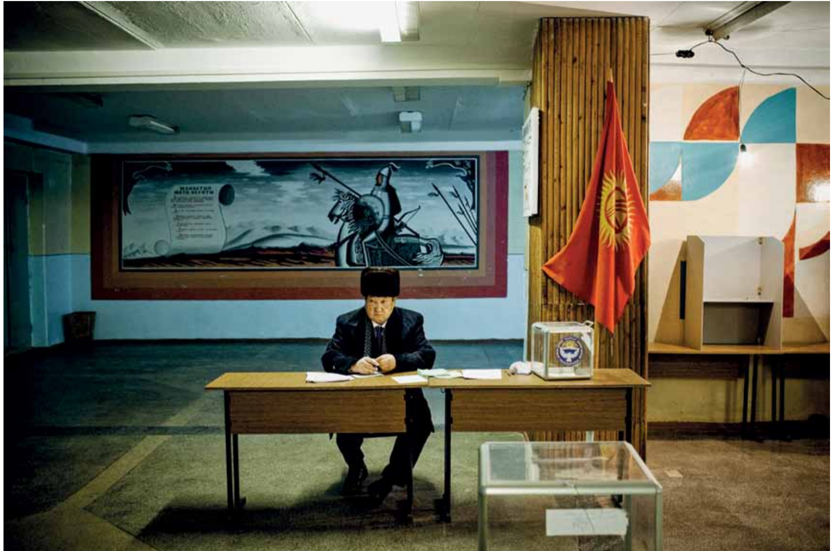
NEAR BISHKEK, KYRGYZSTAN. The day of the Parliamentary elections in a village around Bishkek in 2007. The elections contained many irregularities. The entire opposition got only seven seats out of 89, with the largest opposition party not winning any seats.

MOSTEIRO DE SANTA CLARA-A-VELHA TUE TO SUN AND HOL 10.00–18.00 Ø MON 29 MAY–25 JUL