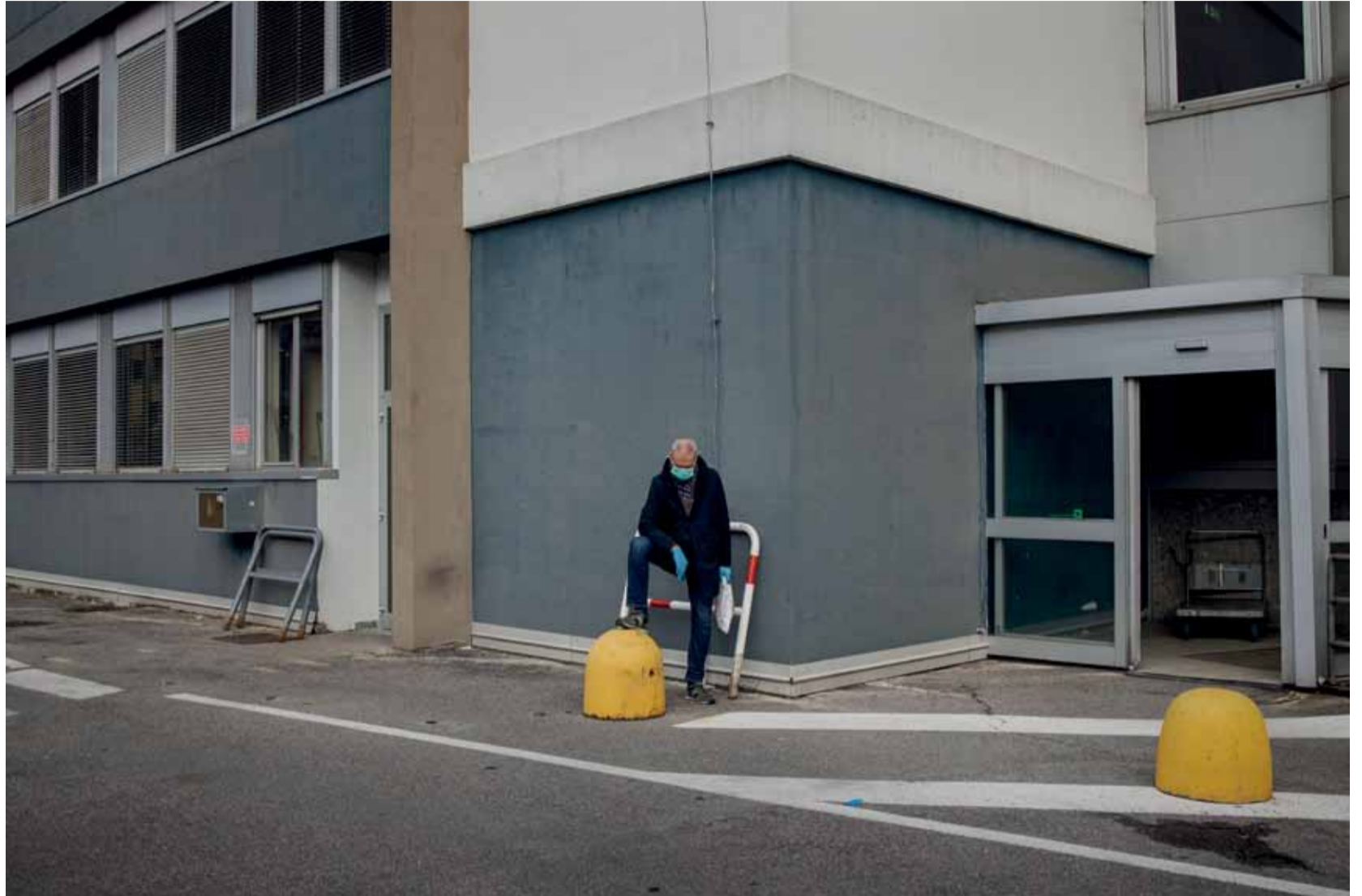
© FABIO BUCCIARELLI MARCH 15, 2020, SIERATE, BERGAMO PROVINCE, ITALY. A man wearing a mask stands in front of Bolognini Hospital in Sierate.

FABIO BUCCIARELLI WHEN EVERYTHING CHANGED COVID-19: THE EUROPEAN EPICENTER EXHIBITION SPONSORED BY FUNDAÇÃO JOANA VASCONCELOS © FABIO BUCCIARELLI FOR THE NEW YORK TIMES